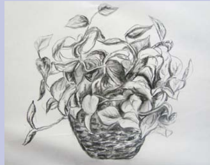
Drawing and Portraiture." Chris will be leading another drawing course this spring, "Beginning Figure Drawing," for novices or those who want an opportunity to continue building their skills.