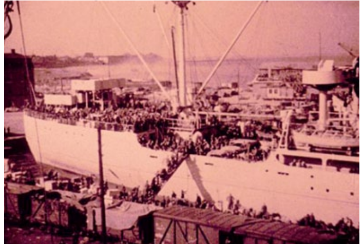
Estonian refugees board a German ship during evacuation ahead of the advancing Russian army in 1944.

The answer came, almost by accident, in the powerful force of song. One summer evening in 1989 a group of independence advocates decided to march from the center of Tallinn to the national singing grounds, five miles away. By the time the impromptu parade reached