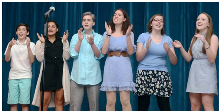
Members of the New London Barn Playhouse Junior Intern Company