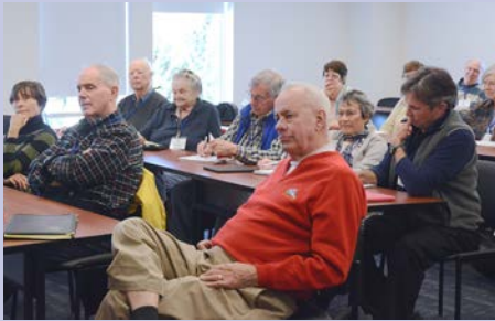
Participants in The Supreme Court course