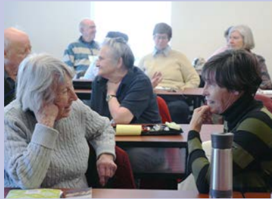
Participants chatting during break in The Supreme Court course