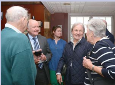
Conversation at the college's Last Monday event in April