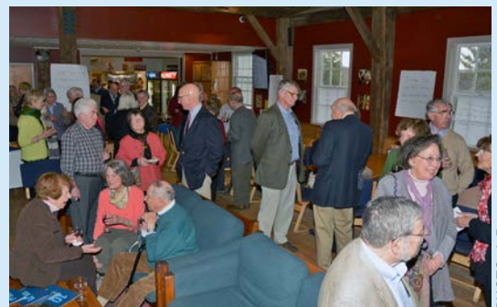
AIL membership at the college's Last Monday event in April held in Galligan's Pub.