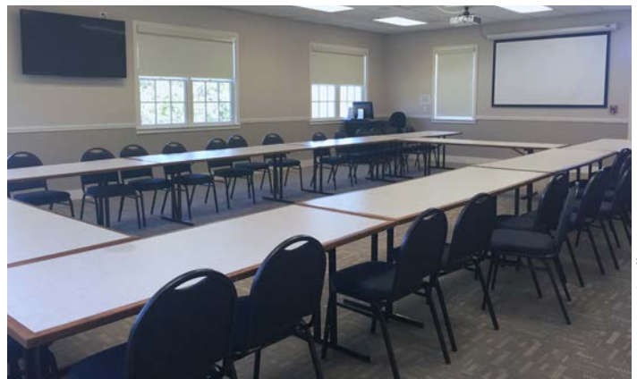
Adventures in Learning Classroom